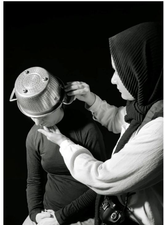
In the photography process of Mahdiyeh Afshar Bakeshloo

Each photograph is a stand-alone visual poem, built on empty space, stark contrasts, and restrained composition. Faces are often hidden or